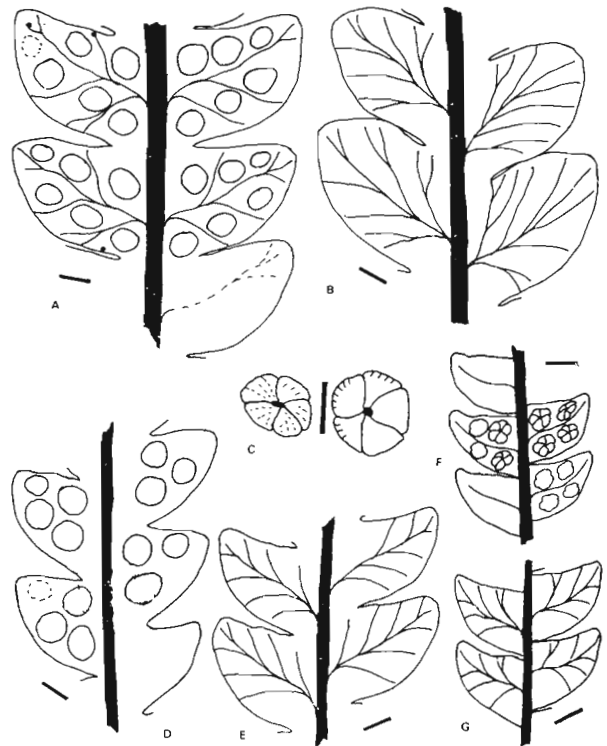
Text-figure 1 —A, B and C, Gleichenites pallegoi ; D, E, Gleichenites sp.; F, G, Gleichenites cachiavartensis (Bars are = 1 mm, except C where =0.5 mm)

Diagnosis —Fronds of unknown shape and size, at least bipinnate; main rachis 0.8-1 mm thick. Largest segment up to 8-9 cm long x 10 cm wide. Pinnae linear, up to 6 cm long x 7 mm wide, attached to the main rachis at 50°-60°, separated 6-8 mm. Pinnules cladophleboid, slightly falcate, united at the base;