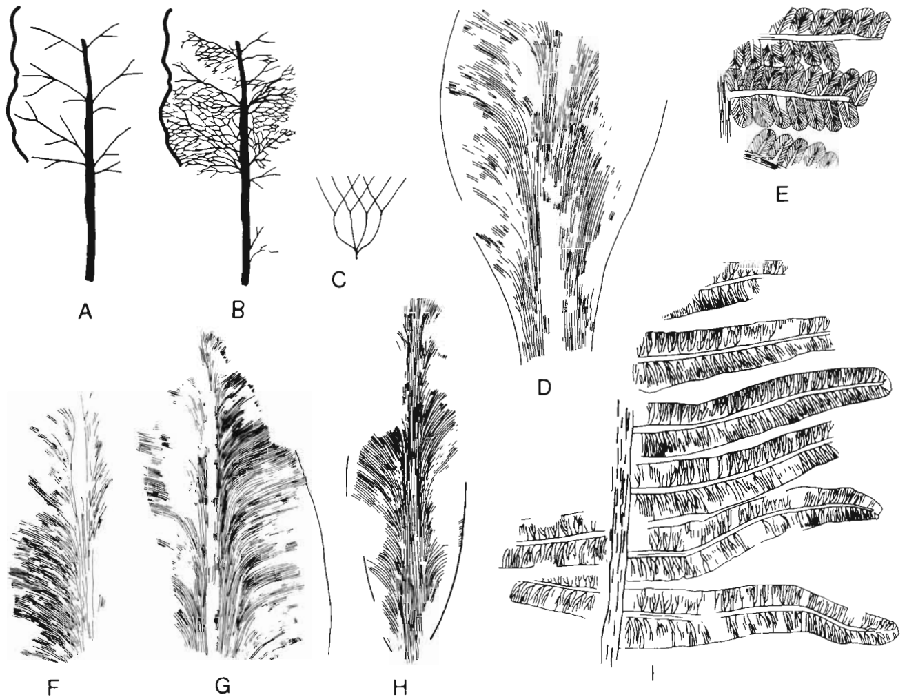
Text-figure 2 —Figure A, B, approximately x 1.5; figure C, diagrammatic; other figures natural size. A-C Gigantonoclea iriani sp. nov. A . Pattern of primary (midrib) and secondary venation: and B . with the tertiary venation superimposed; A and B drawn from the holotype. C . Mode of branching in the tertiary variation. Irregularities have been caused by wrinkling of the specimen prior to burial, and the state of preservation. D . Glossopteris sp. H. 79 RY 189A. E . Pecopteris sp. A (= Pecopteris sp. cf. P. monyi of Wagner, 1962). F . Glossopteris iriani sp. nov. Holotype. 80 BH 302D. G . Glossopteris sp. F. 79 RY 189A. H . Glossopteris sp. C. 79 RY 189A. I . Fascipteris aidunae sp. nov. Holotype 79 RY 188C.

Origin of name —From Irian Jaya, the name of the Indonesian province.