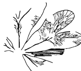
Text-figure 3 — Koraua hartonoi sp. nov. Whorled or tufted specimen borne on a longitudinally ribbed stem. 80 AG 64B. Paratype.

Other species figured and listed on Table 1 are not discussed as further work is needed.