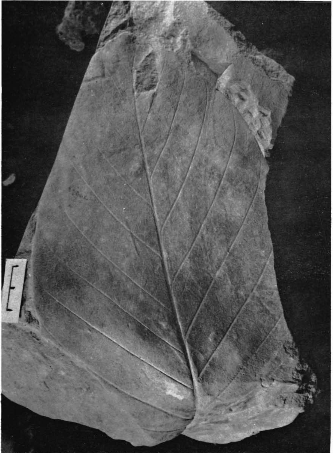
Figure 1— Dipterocarpus siwalicus sp. nov. \times Natural size. Specimen no. BSIP 35859.

straight to uniformly curved, unbranched, intersecondary veins absent; tertiary veins ( 3^\circ ) with angle of origin about 70^\circ - 80^\circ ; pattern percurrent, course somewhat wavy, unbranched, running obliquely in relation to mid-vein, arrangement