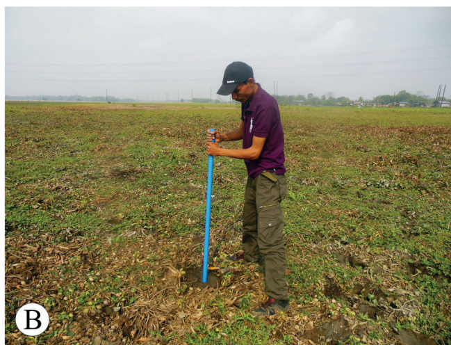
Fig. 2—A. View of a Pashumara Wetland, B. A field photo of sample collection by PVC pipe from the Wetland.