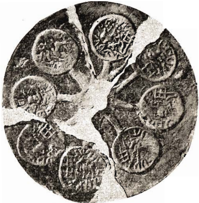
TEXT-FIG. 1—Reconstruction of the obverse face of a disc (after Sahni).

minute observation and interpretation of the evidence writ on its visage. But, perhaps, this particular interest in something really concerned with ancient India may be attributed to his early training in Sanskrit which, as he told me at a later date, was one of the subjects for his Matriculation. He treated the fragmentary pieces of coin moulds with the same patience and understanding as he had been wont to apply to plant fossils. Once he had set apart a compartment of his brain for this material, his mind was constantly working like a sieve, sifting evidence from many a source that he could lay his hands upon. Not only did he consult leading archaeologists in India like the late Dr. K. P. Jayaswal who at once realized the importance of the find and encouraged Dr. Sahni to undertake a study of the coin-casting apparatus in ancient India, but also approached foreign experts for the elucidation of his material. He also contacted